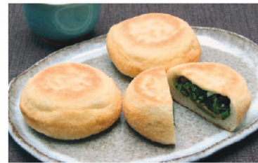
Filled Buns with pickled Nozawana and Mushrooms